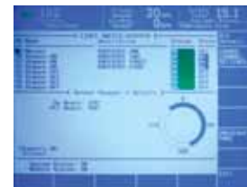
KNOCKOUT TIMING SCREEN